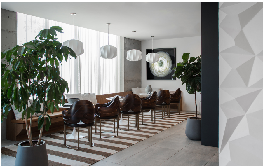
Jónsdóttir's seating joins custom banquettes of walnut and leather atop an Ariana Rug in the lobby.