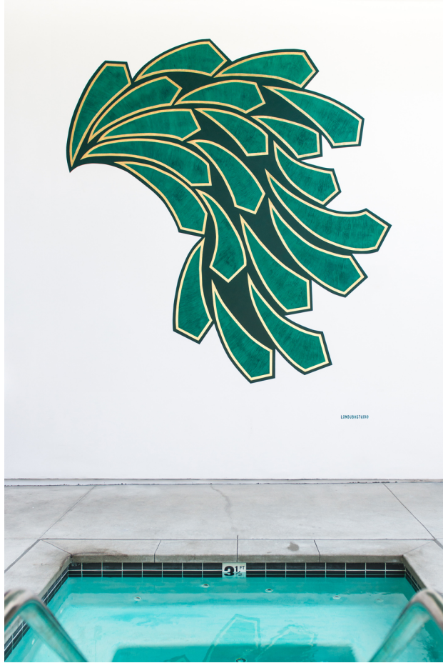
A Londubh Studio leaf mural in 23kt gold leaf and textured plastic enlivens the 2 nd Floor outdoor pool area.