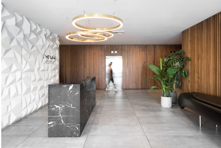
A custom desk clad in marble underneath a J. Alexander chandelier announces reception; walls are custom walnut wall paneling, and the bench is by Bianco Bianco.